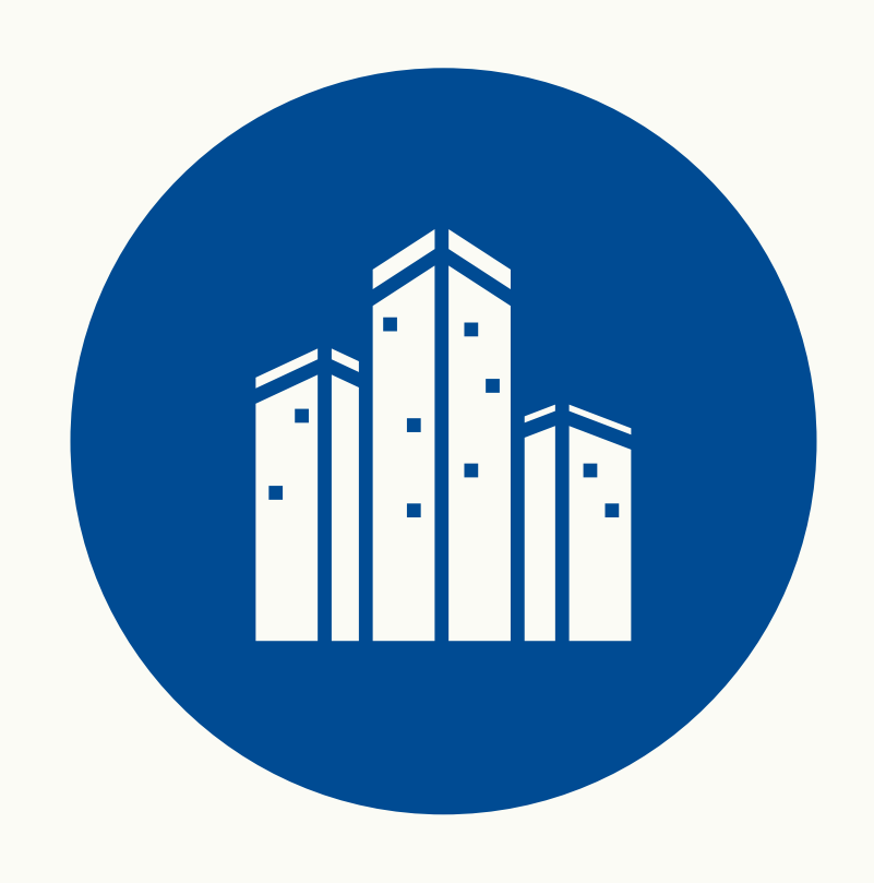
Project Sole Selling