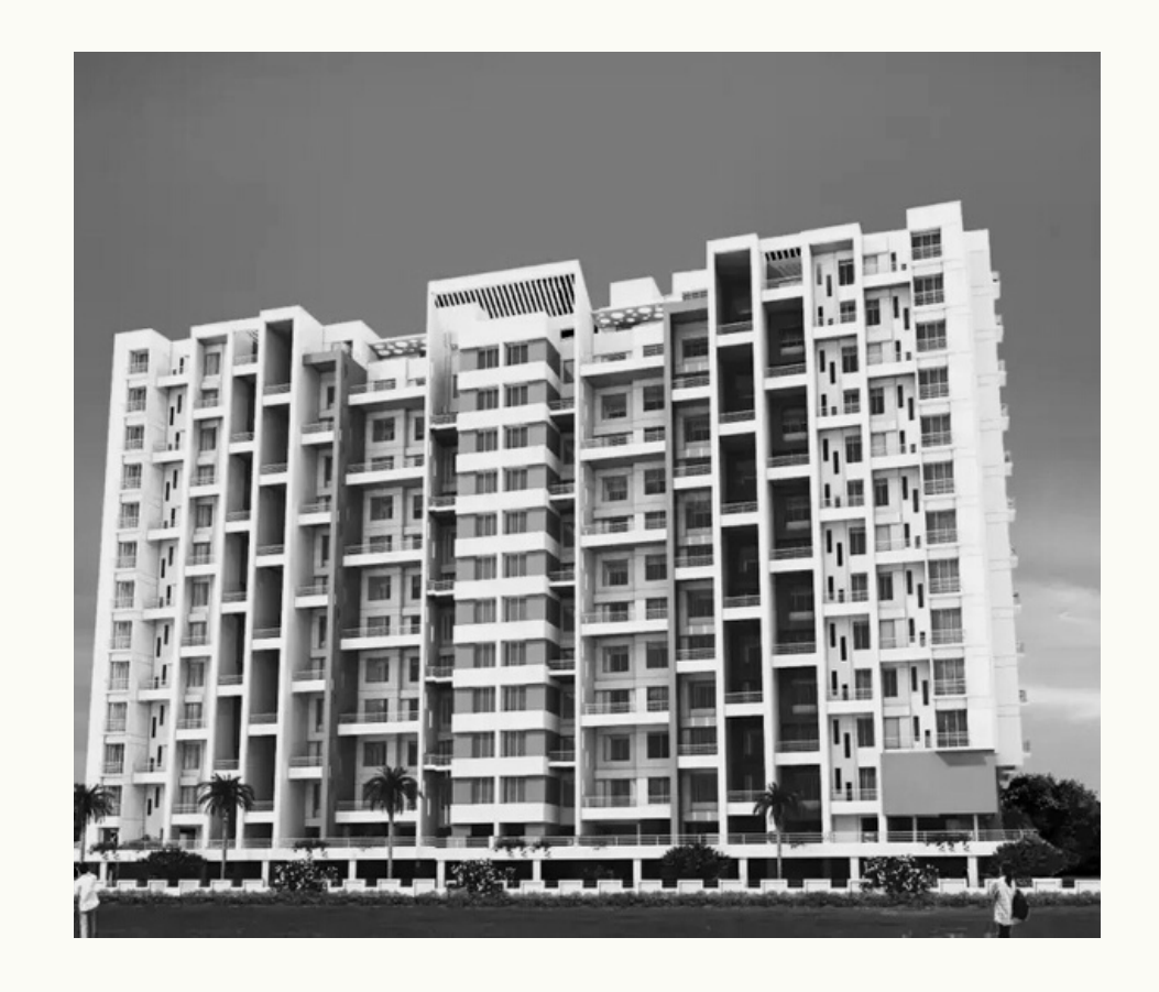
Karan tej Paramount